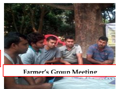
Farmer's Group Meeting